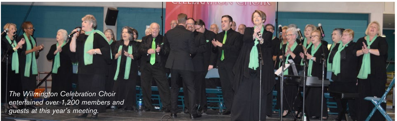
The Wilmington Celebration Choir entertained over 1,200 members and guests at this year’s meeting.