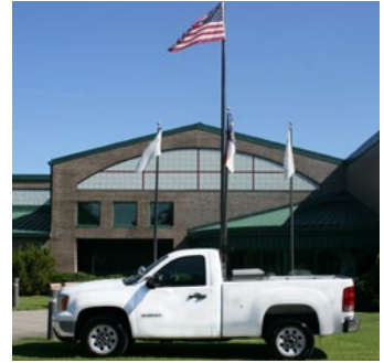
There will be great prizes for those who register, including the grand prize of a 2010 GMC Sierra pick-up truck!

Whisnants" will be performing this year, and have performed gospel music all across the nation and around the world, including Canada, Hawaii, Bahamas, Belize and Mexico. Entertainment begins at 5:30 p.m.—a performance you will not want to miss! This will give you an opportunity to enjoy the entertainment before the beginning of the business meeting which kicks off at 7 p.m. Refreshments will be served beginning at 5 p.m.