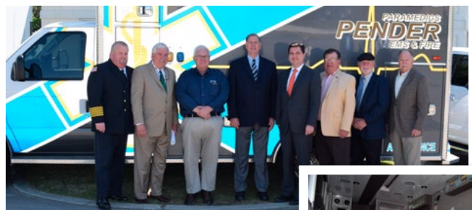
Above and right: Pender EMS and Fire, Inc. recently added a new ambulance, first responder 911 vehicles and upfitted vehicles that provide emergency medical services.