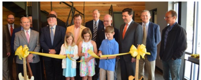
Local and government officials gathered in Burgaw for the grand opening of Mojotone LLC, pictured below.